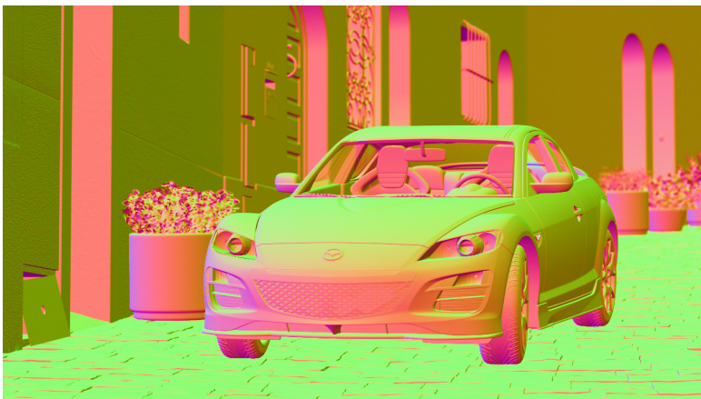
Figure 3.6 – Example normal image obtained using the first diffuse or glossy (non-delta) hit. Note that the normals of perfect specular (delta) transparent surfaces are computed as the Fresnel blend of the reflected and transmitted normals.