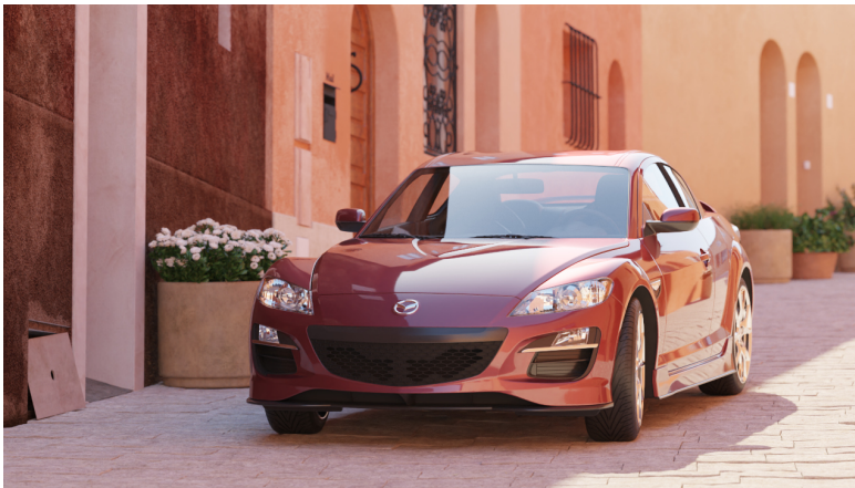
Figure 3.2 – Example output image denoised using color and auxiliary feature images (albedo and normal).

strict requirement but too much noise in the feature images may cause residual noise in the output. Also, all feature images should use the same pixel reconstruction filter as the color image. Using a properly anti-aliased color image but aliased albedo or normal images will likely introduce artifacts around edges.